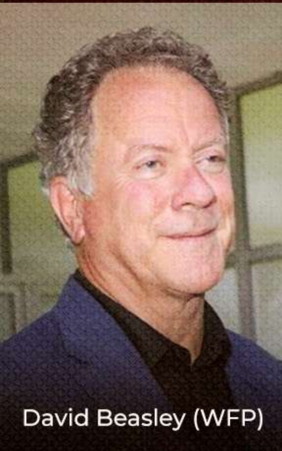
David Beasley (WFP)