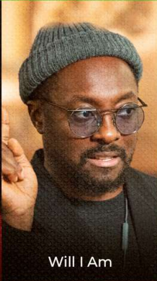
Will I Am