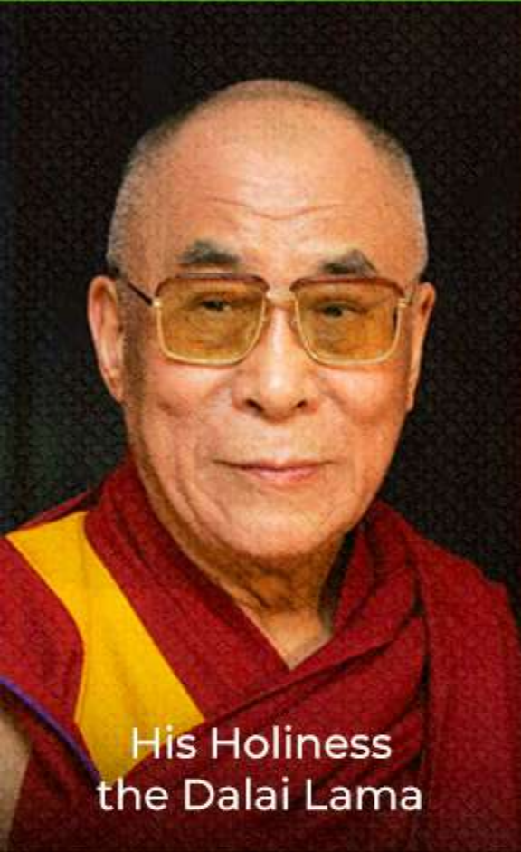
His Holiness the Dalai Lama