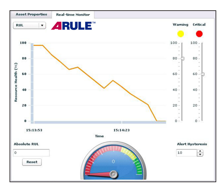
Remaining useful life representation of a system with ARULE API deployed in a Sentinel IT™ application

ARULE is versatile and can be used for determining electronic and mechanical fatigue damage. The reasoner calculates FFP signatures, accurate RUL (time-to-failure) estimates, and SoH estimates, which provide an early warning indicator for system maintenance personnel to schedule service to the system prior to catastrophic failure.